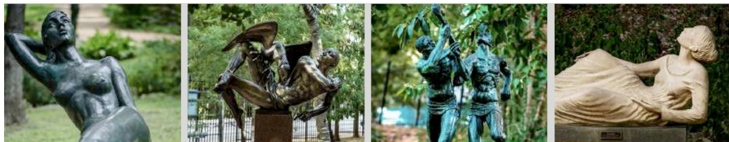
LEFT TO RIGHT: RECLINING NUDE, PROMETHEUS, THE TORCHBEARERS, POETESS