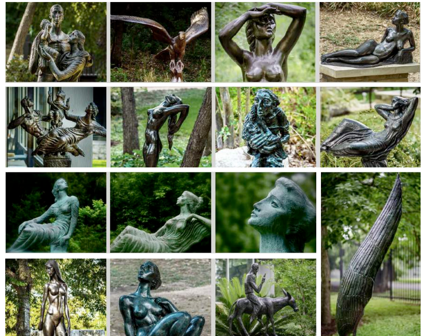
LEFT TO RIGHT: FAMILY, EAGLE, EVE, RECLINING NUDE, HOPE OF HUMANITY, BALLERINA, REFUGEES II, RECLINING FIGURE I, MUSE I, MUSE II, MUSE III, EVA CON MELA (EVE WITH APPLE), SEATED BATHER, ENTRANCE TO JERUSALEM, ANGEL'S WING